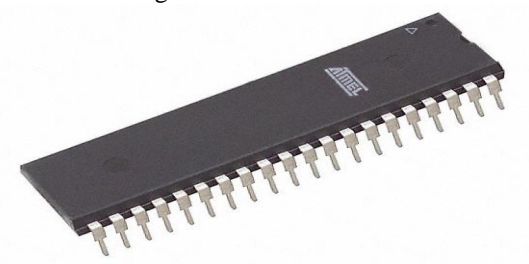
Fig.2. AT89C51 Microcontroller

AT89c51 microcontroller is used as a low-power, high performance CMOS 8-bit microcontroller with 4Kbytes of in-system programmable Flash memory. The device is created using Atmel's high density non-volatile memory technology and is compatible with the industry-standard 80C51 instruction set and pin out. The on-chip Flash gives permission to the program memory to be reprogrammed in-system or by a conventional non-volatile memory programmer. By combining a versatile 8-bit CPU with insystem programmable Flash on a monolithic chip, the Atmel AT89c51 is a powerful microcontroller which gives a highly-flexible and cost-effective solution to many embedded control application. The Idle Mode stops the Central processing unit (CPU) while allowing the RAM, timer/counters, serial port, and Interrupt system to continue functioning.