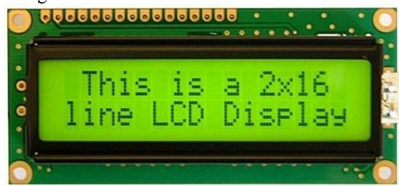
Fig.3. LCD Display

LCD (Liquid Crystal Display) screen is an electronic display module and plays as an important role in a wide range of applications. A 16X2 LCD display is very commonly used in various devices and circuits. These modules are used over seven segment LED's and other multi segment LED's.